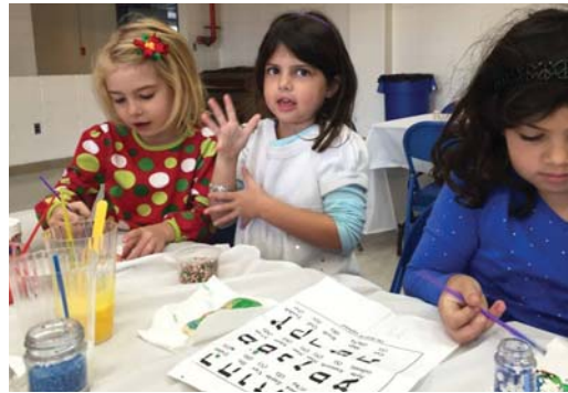
Children enjoy decorating cookies at the December Meeting.

At our latest meeting in December, the Chevy Chase Citizens Association hosted a holiday celebration of community with cookie decorat-